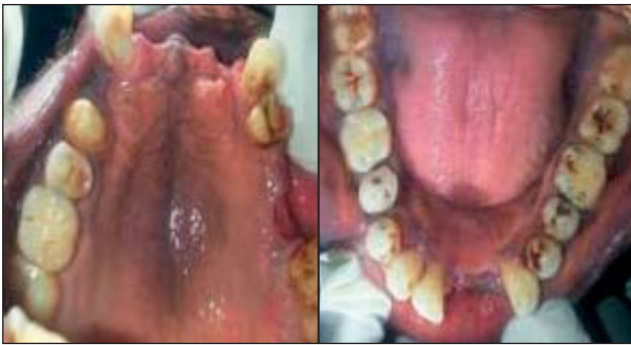
Figure 1: Pre-operative view showing partial edentulism in maxillary and mandibular arches