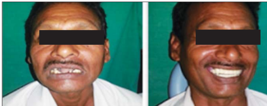
Figure 7: Pre operative and Post-operative view