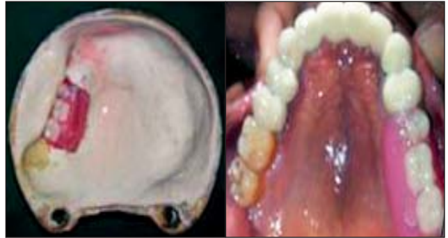
Figure 6: Acrylisation of removable component and final prosthesis