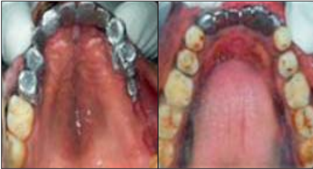
Figure 5: Metal try in