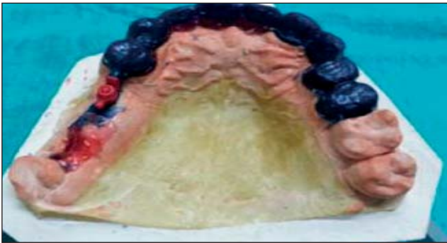
Figure 3: Male component attached to the wax pattern