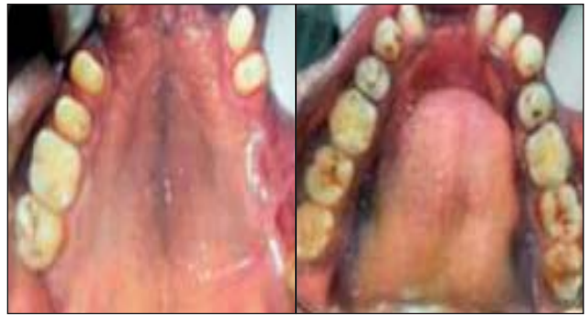
Figure 2: Tooth preparations done in relation to 13, 14, 22, 24, 25 in maxillary arch and 32, 33, 43 in mandibular arch .