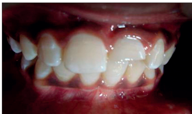
Figure 1: Coronal fracture of maxillary central incisor