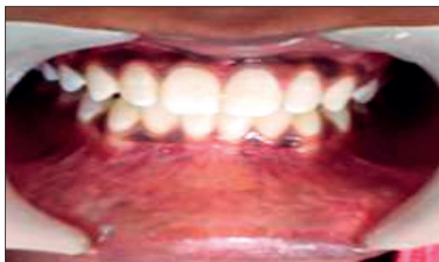
Figure 4: Tooth fragment reattached, showing good aesthetic results.