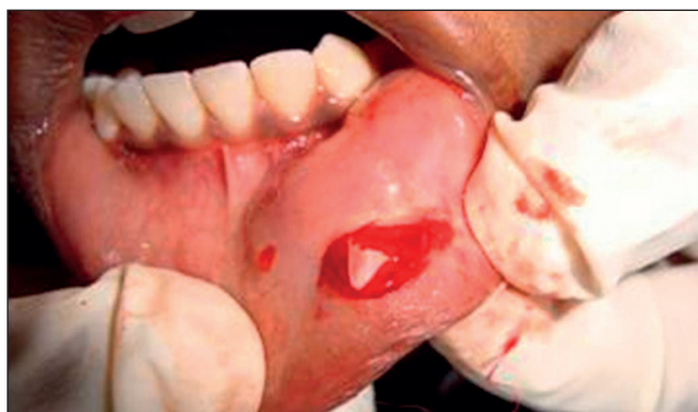
Figure 3: The removed tooth fragment. The tooth fragment was carefully removed and checked for the fit with the tooth; and immediately maintained in normal saline during the whole period prior to restoration.